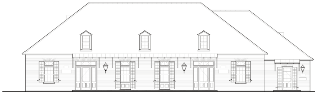
9'0" MSL Finish Floor Elevation